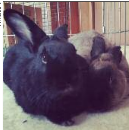
Scrappy and Coco.

After only a week of living as neighbors, and a few additional dates on neutral territory, they are already bonded and sharing the same run. Other rabbit pairs we've worked with had taken months to bond, so we are fully aware of how lucky we are. We are also so lucky to have this wonderful new addition to our family – the sweet, sometimes silly, always playful, extremely loving Coco.