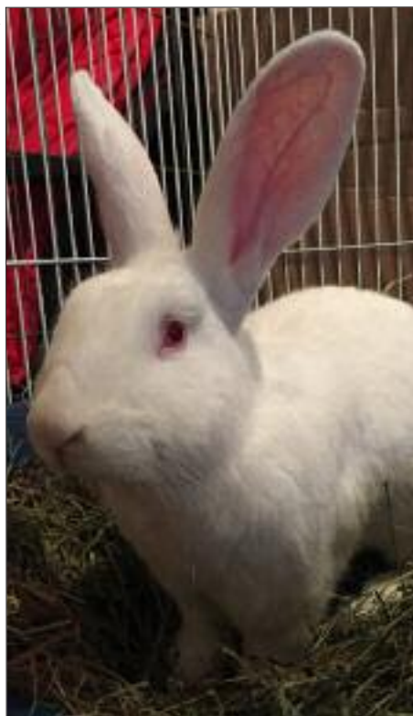
Spooky, who weighs 9 pounds, presents less of a temptation to people who might want to grab and pick up a bunny.

knowing that his safety and well-being depend on your playing with him on his own terms.