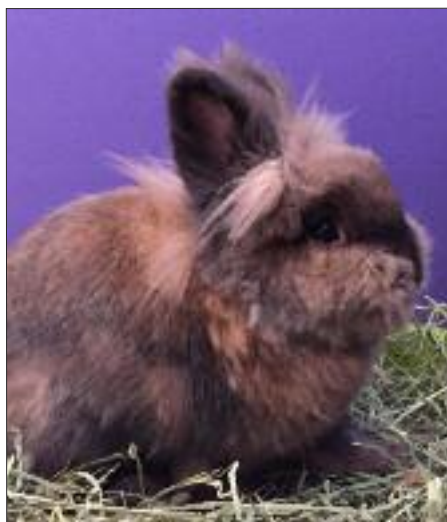
Cute Lil Britches would probably try to bite a stranger who tried to pick her up!

Imagine what the world looks like to this bunny. She’s surrounded by a new environment, and there’s a big, strange-smelling animal that’s always looming over her. She has no idea you’re trying to be friendly. Her “hard wiring” tells her: “AAAAAAGH!!! It’s going to EAT ME!” Imagine yourself in her bunny slippers: No one speaks her language; she has been taken from her family and has no one of her own species to comfort her; and she has no idea whether you