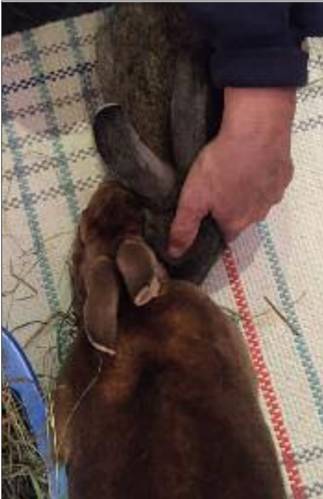
Speed date: Moondog, top, with Minchie.