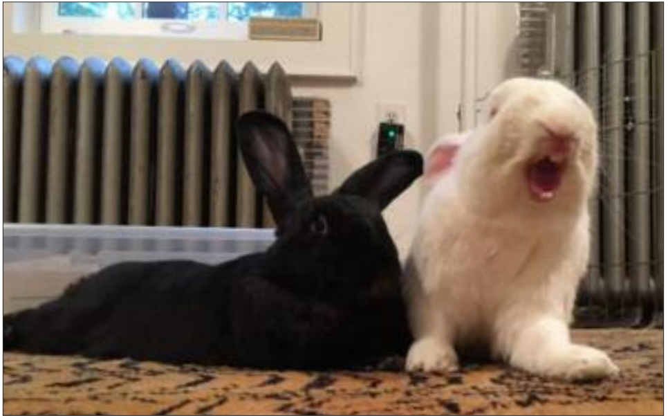
Moose and Spooky.