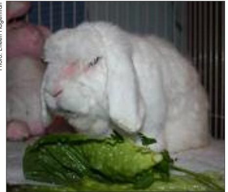
Zachariah's first week at home.