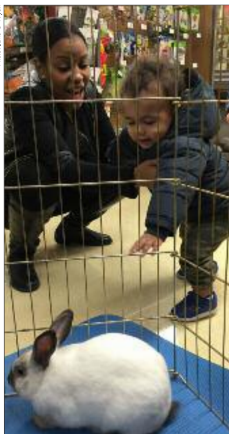
Marshmallow, at Petco Union Square, is protected from an impulsive admirer.