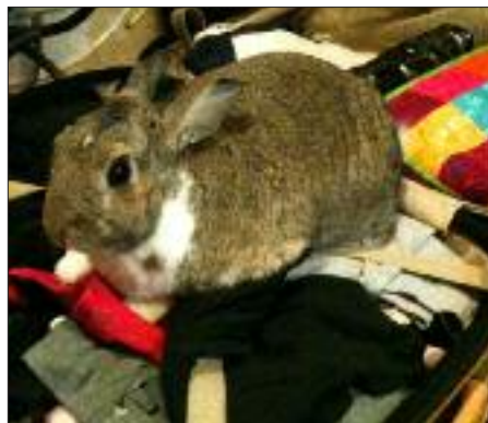
He would jump into my suitcase as if to say, "don't go" or "take me with you."

Mr. Trix gave me unconditional love. My family is scattered all over the globe, and friends and boyfriends have come and gone over the years, but he was always at my side. He loved me when I was dolled up for an audition, or at the top of my game doing really well in life and feeling really good about things. He loved me just as much when I was in sweat pants, getting chubby after the holidays, or just feeling exhausted from dealing with the harsh realities of being a performing artist in New York. He