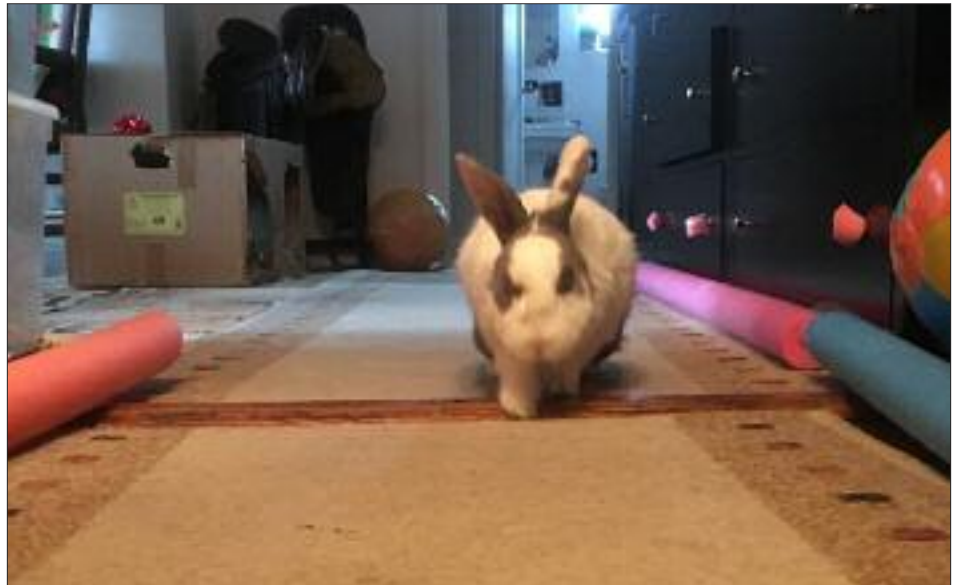
Lola on the go between pool noodles.

Now Lola primarily hops between the bedroom and kitchen, choosing to forgo the larger living room where it’s harder to get her bearings. Also I’ve found when you pick up a sight-impaired bunny, it’s very important to put her down in her hay box or someplace where she knows 100% where she is. If I put Lola down in a random spot, even in a room she’s very familiar with, it becomes stressful and confusing until she finds something familiar to touch.