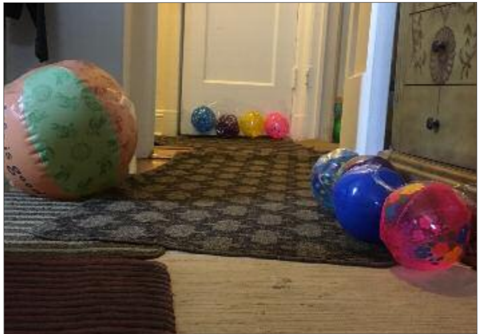
Little beach balls are attached to walls.